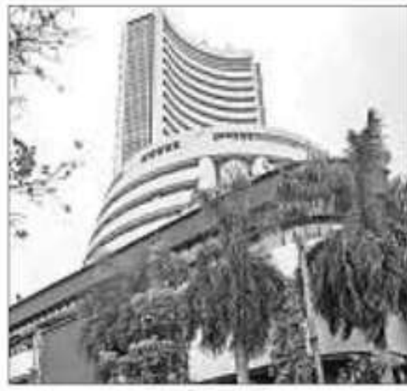
सूचकांक में मजबूत हिस्सेदारी रखने वाले एचडीएफसी बैंक और रिलायंस इंडस्ट्रीज में लिवाली से बाजार में तेजी रही।

सूचकांक में मजबूत हिस्सेदारी रखने वाले एचडीएफसी बैंक और रिलायंस इंडस्ट्रीज में लिवाली से बाजार में तेजी रही। तीस शेयरों पर आधारित बीएसई सूचकांक 126.21 अंक यानी 0.15 फीसद की बढ़त के साथ अपने अवतक के उच्चतम स्तर 81,867.55 अंक पर बंद हुआ। कारोबार के दौरान एक समय यह 388.15 अंक की बढ़त के साथ 82,129.49 अंक तक चला गया था।