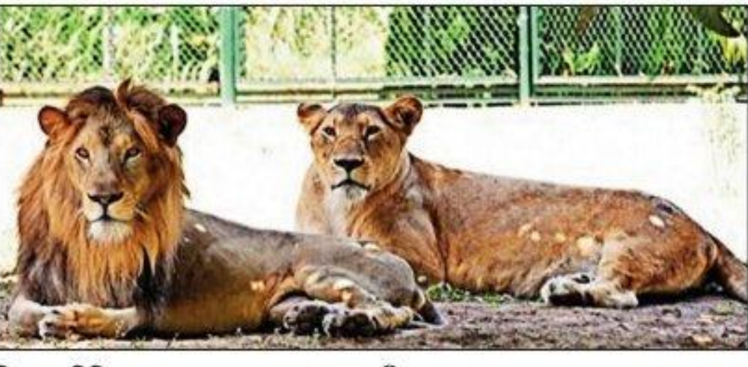
ত্রিপুরার চিড়িয়াখানা থেকে আসা আকবর ও সীতার নতুন নাম হয়েছে সুরজ ও কন্যা

এই সময়, জলপাইগুড়ি: বিধান সভা উপনির্বাচনের আগে ধূপগুড়ি গ্রামীণ হাসপাতালকে মহকুমা হাসপাতালে উন্নীত করার প্রক্রিয়া শুরু হয়েছে। বিশেষজ্ঞ চিকিৎসক পেতে চলেছে এই হাসপাতাল। রাজ্য স্বাস্থ্য দপ্তরের তরফে বুধবার ধূপগুড়ি হাসপাতালে আরও ১২ জন বিশেষজ্ঞ চিকিৎসক নিয়োগের নির্দেশিকা জারি করা হয়েছে। মহকুমা হাসপাতালের মর্দাদি পাওয়ার পরে স্বাস্থ্য ভবন থেকে ৩৫ জন নার্সকে যোগ দেওয়ার জন্য নির্দেশনা দেওয়া হয়েছে। আর এ বার একসঙ্গে ১২ জন বিশেষজ্ঞ চিকিৎসক পেতে চলেছে এই হাসপাতাল। রাজ্য স্বাস্থ্য দপ্তরের তরফে বুধবার ধূপগুড়ি হাসপাতালে আরও ১২ জন বিশেষজ্ঞ চিকিৎসক নিয়োগের নির্দেশিকা জারি করা হয়েছে। মহকুমা হাসপাতালের মর্দাদি পাওয়ার পরে স্বাস্থ্য ভবন থেকে ৩৫ জন নার্সকে যোগ দেওয়ার জন্য নির্দেশনা দেওয়া হয়েছে। আর এ বার একসঙ্গে ১২ জন বিশেষজ্ঞ চিকিৎসক পেতে চলেছে এই হাসপাতাল। রাজ্য স্বাস্থ্য দপ্তরের তরফে বুধবার ধূপগুড়ি হাসপাতালে আরও ১২ জন বিশেষজ্ঞ চিকিৎসক নিয়োগের নির্দেশিকা জারি করা হয়েছে।