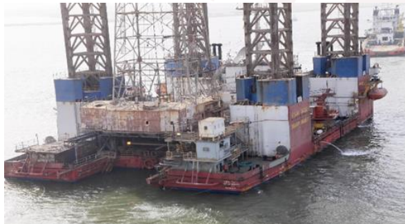
Sagar Samrat Jack up Rig being towed to GPC yard for conversion

The Sagar Samrat conversion project is one of the most complex projects executed by ONGC. The MOPU stands tall in the Arabian Sea, as a testimony, to narrate the stories of several tough decisions taken during its execution and the excellent stakeholder consultation by ONGC which eventually yielded results.