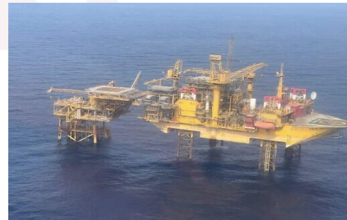
Sagar Samrat, the Legend, stands tall in its new Avatar as MOPU in WO16 Field